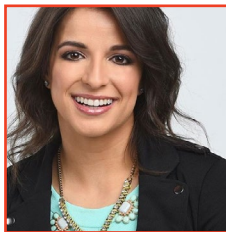
Victoria Arlen ESPN On-Air Personality, Model, Actor, Author, and Olympian