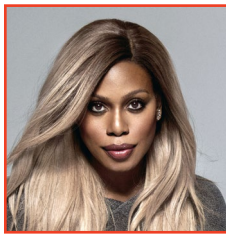
Laverne Cox Award-Winning Transgender Actress, Producer and Equal Rights Advocate