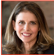
Amy Ziering Executive Producer of The Hunting Ground, Invisible War, and The Bleeding Edge